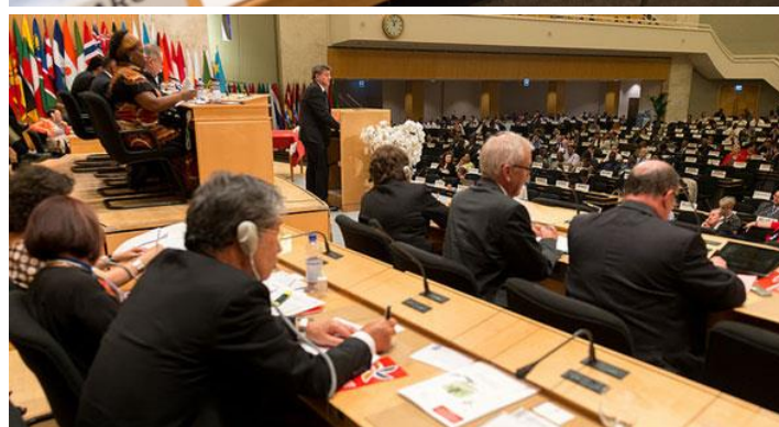
103rd Session of the International Labour Conference, 28 May - 12 June 2014