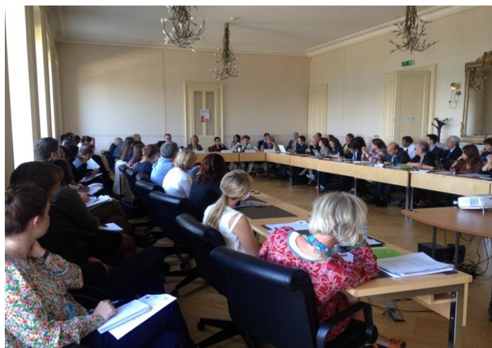
The side event “Decent Work for Migrant Domestic Workers” of the 21 session of The Committee on the Protection of the Rights of All Migrant Workers and Members of Their Families, Geneva, Palais Wilson, 4th September 2014

The side event “Decent Work for Migrant Domestic Workers” of the 21 session of The Committee on the Protection of the Rights of All Migrant Workers and Members of Their Families co-hosted by the United Nations Office of the High Commissioner for Human Rights (OHCHR) and the International Labour Organisation (ILO) was held on 4 th of September at the Palais Wilson in Geneva. This event was organized in the framework of the EU funded project “Global Action programme on Migrant Domestic Workers” and was designed as a forum to raise awareness on the human rights challenges faced by migrant domestic workers, including the discrimination they often face, to ensure the design and effective implementation of protective legislation and redress mechanisms, and to improve their organizational capacities.