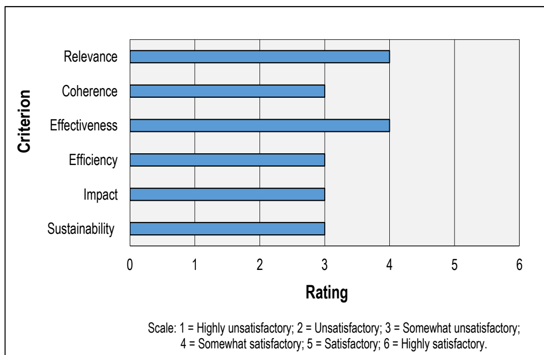
Figure 2. Performance by criterion: Public-private partnerships