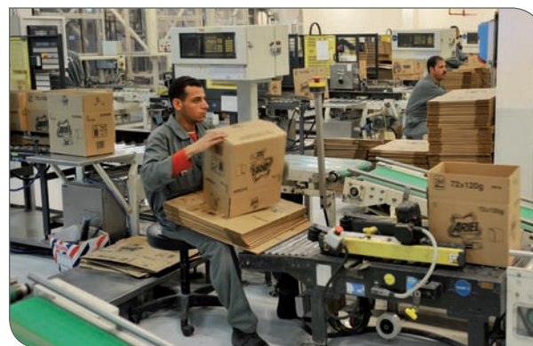
Strengthening people's capacity to create sustainable enterprises and decent work