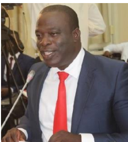
H.E. Mr Ignatius Baffour Awuah

Mr Ryder was elected as ILO Director-General by the ILO's Governing Body in May 2012 and took office on 1 October 2012. He was re-elected as ILO Director-General by the ILO's Governing Body on 7 November 2016 with overwhelming support across the "ILO's tripartite constituency". His second term started on 1 October 2017.