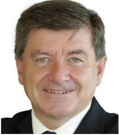
Mr Guy Ryder

Director-General, International Labour Organization (ILO)