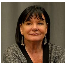
Ms Sharan Burrow