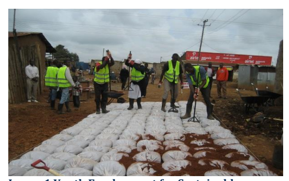
Image 1 Youth Employment for Sustainable Development project in Kenya

Public employment programmes: Innovations public in employment programmes through green works in water management. forestry and other infrastructure-related works have demonstrated to be efficient in promoting climate resilient sustainable development, but also essential in providing employment and additional income opportunities to those most affected and vulnerable to the impacts of climate change. Countries such as South Africa ("Working programmes), Ethiopia (Productive Safety Net Programme) or India (Mahatma Gandhi National Rural Employment Guarantee Act) have illustrated the key role such interventions can have as part of public employment programmes which are also contributing to social protection floors. They can assist exposed populations to cope with the impacts of climate change and to adapt successfully offering employment to the physically-abled to work.