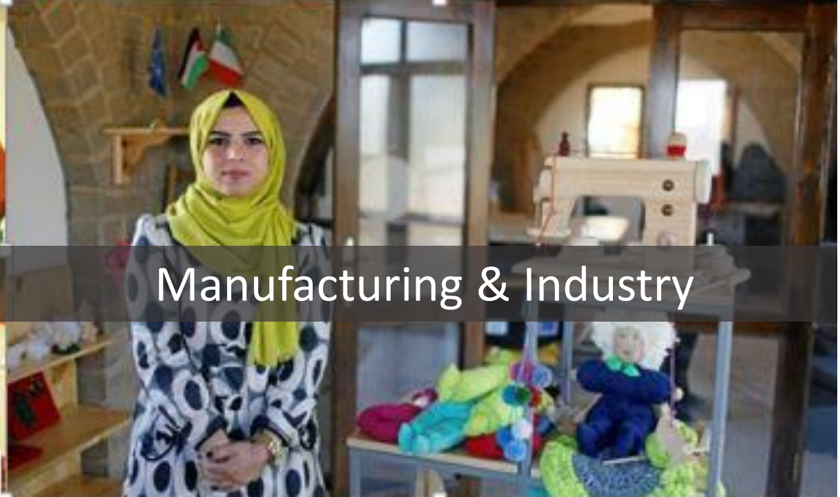
Manufacturing & Industry