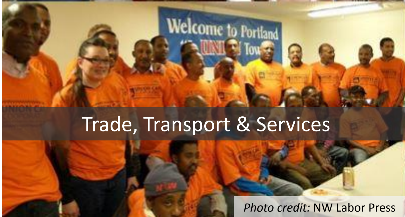
Trade, Transport & Services