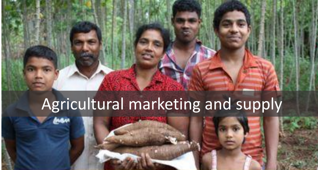
Agricultural marketing and supply