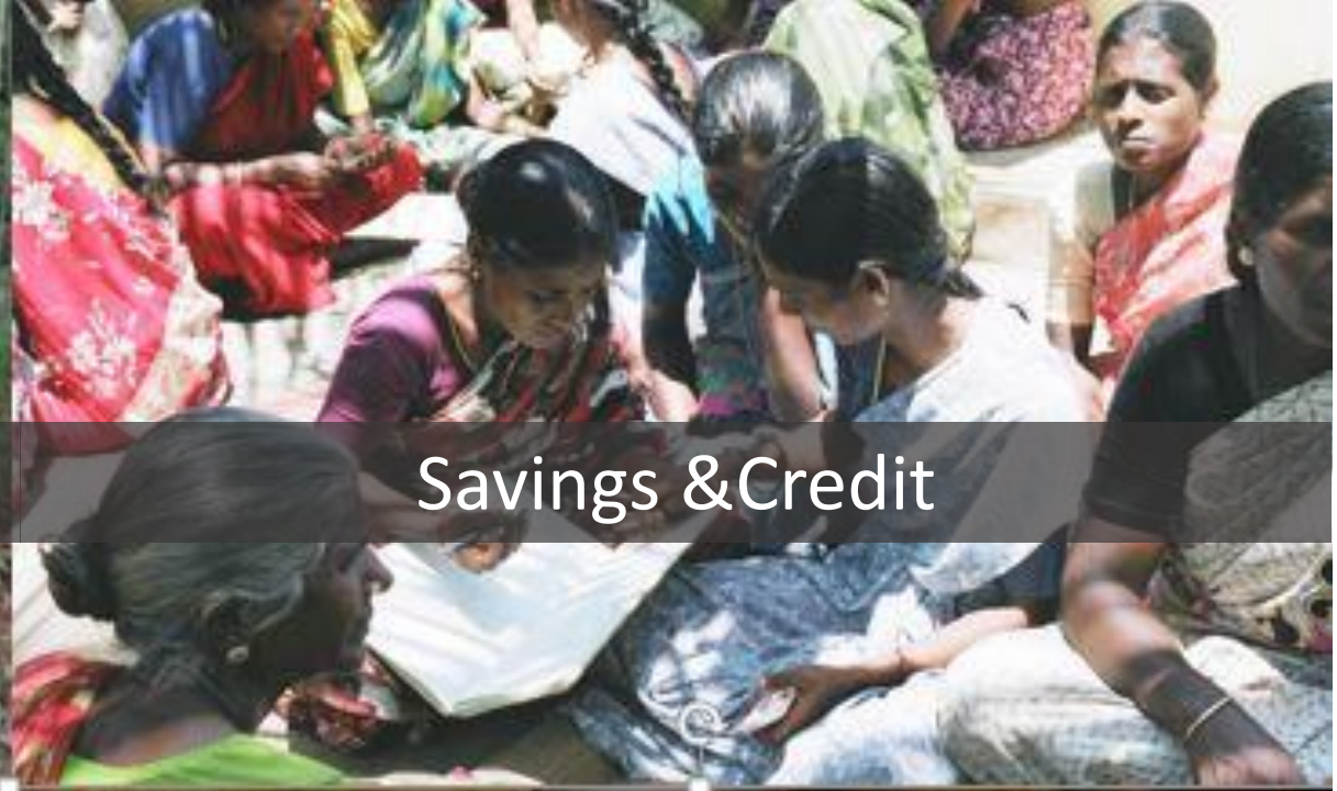
Savings & Credit