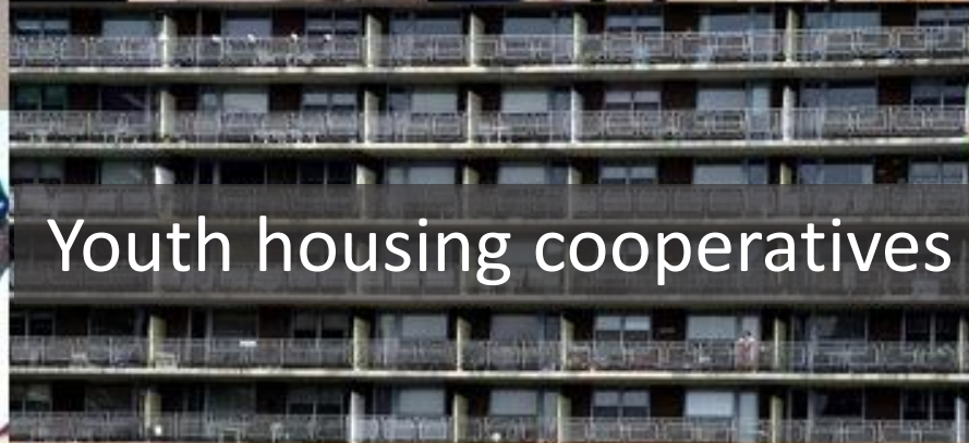
Youth housing cooperatives