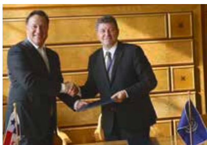
H.E. Mr. Juan Carlos Varela Rodriguez, President of the Republic of Panama (left) with Mr. Guy Ryder, ILO Director-General (right), 104th Session of the International Labour Conference. Geneva, 11 June 2015

2015 in Geneva, The President of Panama, Juan Carlos Varela, told the annual conference of the International Labour Organization (ILO) that the key challenge was to ensure that economic growth was accompanied by an improvement of people's living conditions,