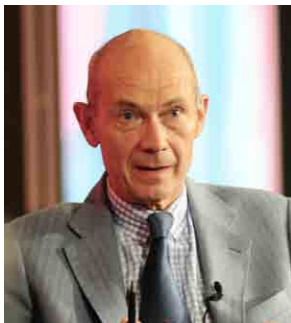
Pascal Lamy WTO Director-General

“We consider this volume a step in the direction of a better understanding of the mechanisms through which globalization affects workers and of the measures that governments can take to give globalization a strong social dimension.”