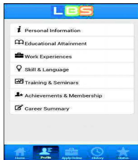
Figure 4: Screenshot of LBS Mobile Recruitment Application