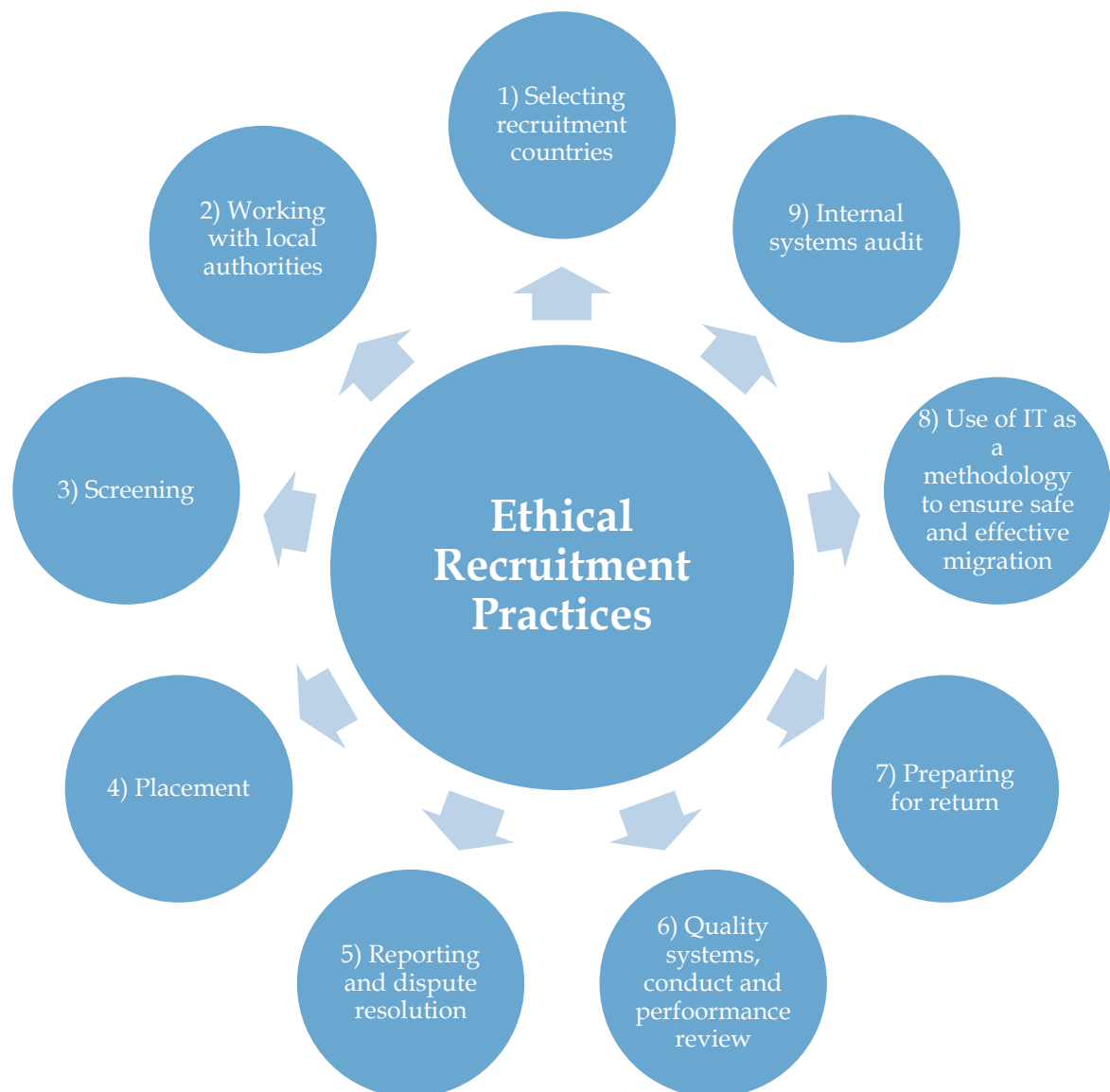
Figure 1: Areas of intervention for recruitment agencies related to ethical recruitment practices