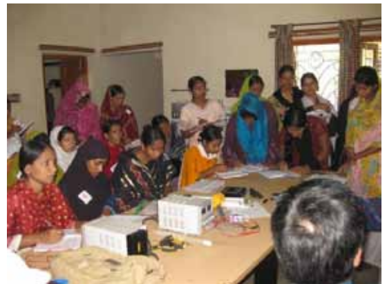
Training workshop on Solar Home Systems, Bangladesh, 2011

The Green Jobs in Asia Project (supported by the Australian Government – ILO Partnership Agreement) aims to promote Green Jobs in Bangladesh through capacity building of constituents, skills development and support in the renewable energy sector. Work in Bangladesh began in 2008-2010 under the framework of the ILO Green Jobs Initiative where renewable energy was identified as one of the key sectors for intervention. A Public-Private Partnership was successfully initiated to promote green employment, involving Grameen Shakti and the Bureau of Manpower Employment and Training (BMET), who agreed to support the training of solar technicians. As part of the activities of the project, the ILO and BMET conducted a 'Training of Trainers' workshop on Solar Home Systems in Bangladesh in November 2011. The training curriculum and packages have a focus on competency standards and ensure the integration of modules on Occupational Safety and Health and Workers' Rights for Solar Technicians as well as modules on Business Management and Entrepreneurship. The project also includes green job creation for women by developing a viable business development model and providing access to finance for the women entrepreneurship development programme.