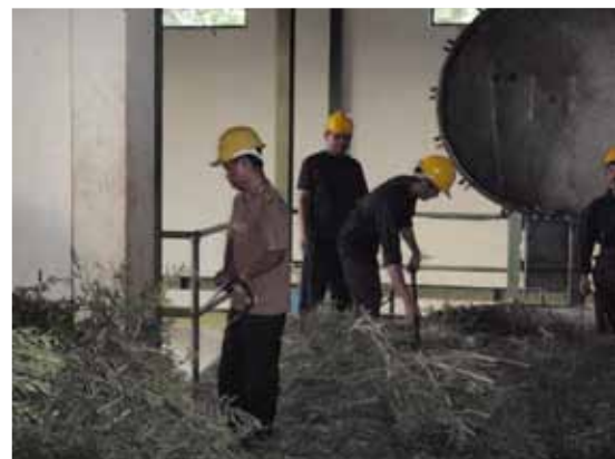
Workers in a rural factory processing raw materials from a community forestry project to produce oil, Indonesia, November 2011

The workshop focused on how public investment can serve climate change adaptation and employment generation purposes. Drawing on international experience, it referred extensively to the ILO's approaches and programmes on green works and 'employment-intensive investment'. Technical sessions focussed on local resource-based methods for investing in soil and water conservation, irrigation, community forestry, rural transport and flood protection. The workshop stimulated discussions about how these methods can be mainstreamed into national policies, public employment programmes and infrastructure investment plans.