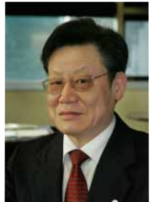
Mr. Sha Zukang, Secretary-General of Rio+20

In the Asia and Pacific region, discussions have primarily focused on employment, income distribution, sustainable livelihoods and working conditions while designing and assessing the effectiveness of 'green' policies. Talks have been particularly vibrant during the international consultations held in preparation of the Rio+20 summit in Beijing, 8-9 September 2011 and in Delhi, 7 October 2011. The consultations were held at the separate invitations of the Chinese and Indian Governments.