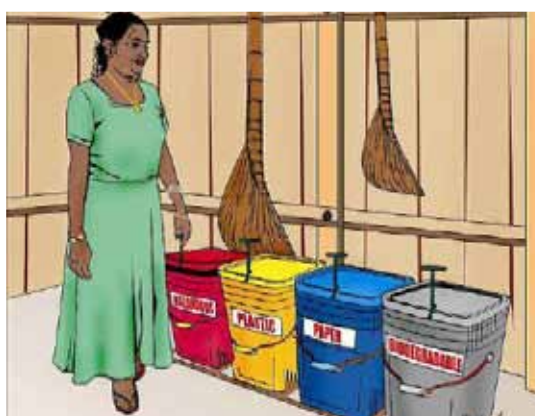
Figure from WARM+ manual (Providing available waste containers near the workplace to facilitate the segregation of waste)

In order to promote jobs in the waste sector that are both decent and environmentally sustainable, the project works in close collaboration with constituents and statutory bodies including the Western Province Solid Waste Management Authority, the Ministry of Environment and Natural Resources, the Central Environment Authority and the Ministry of Local Government and Provincial Council. A value chain analysis is being used to provide an outline of the compost and recycled plastic subsectors, mapping the principal functions and actors involved, and identifying preliminary areas for further research and intervention.