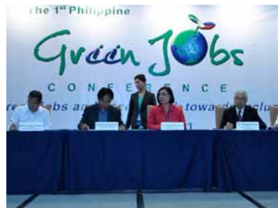
Signing of Green Call, Philippines National conference on Green Jobs, Philippines, August 2011