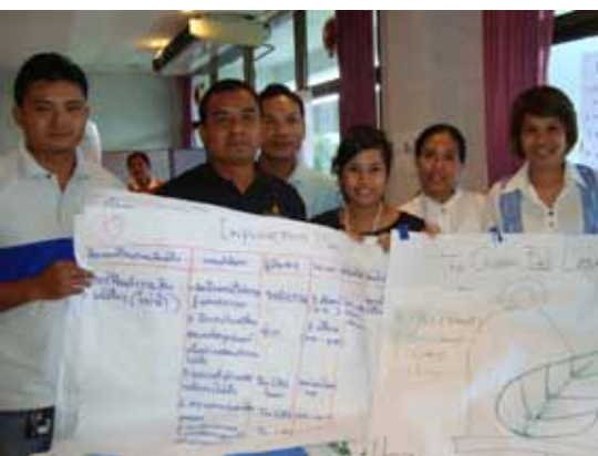
Group discussion during the Hotel Core Training, Thailand, October 2011

equip workers and management with the tools and knowledge resources they need to establish mechanisms of cooperation to jointly create positive changes in their workplaces and enterprises. The pilot programme was launched in Phuket on 7 October 2011, in a session co-hosted by the Phuket Chamber of Commerce and in collaboration with the Faculty of Hospitality and Tourism of the Prince of Songkla University. The participants of the training session ranged from hotel owners, to workers from the housekeeping departments, to HR managers and hotel engineers. They actively discussed the issues and worked together with great motivation and commitment.