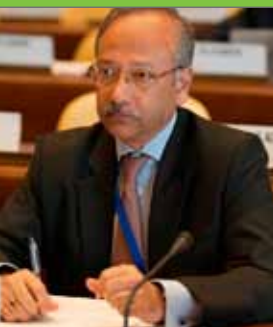
Interview conducted by ILO - RO Asia and the Pacific