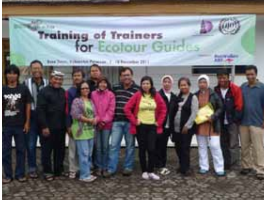
ToT for Eco Tour Guide, Indonesia, November 2011

Under the Green Jobs in Asia Project (supported by the Australian Government – ILO Partnership Agreement), the ILO along with social partners and stakeholders at the national and regional levels, are supporting the Government of Indonesia improve the sustainability of the country's tourism sector. The interventions aim to