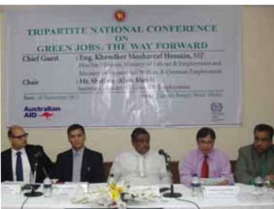
National Conference on Green Jobs, Bangladesh, September 2011

universities, research institutes and the media. The key points of discussion included employment and decent work opportunities in a climate change context, putting the concept of green jobs into practice, options and initiatives to promote green jobs, and technical sectoral presentations on renewable energy.