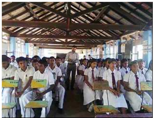
Sri Lanka: Career guidance session

employment – this number is likely to increase dramatically if patterns from previous economic downturns are replicated.