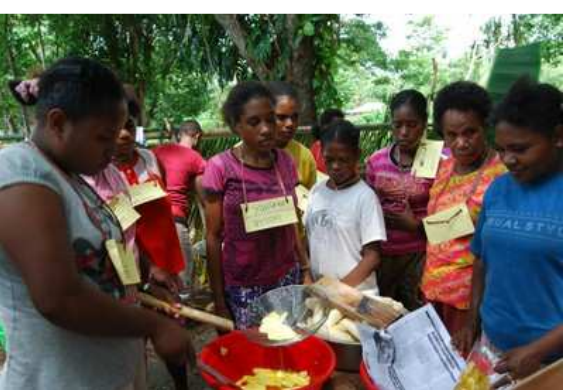
Indonesia: Vocational training