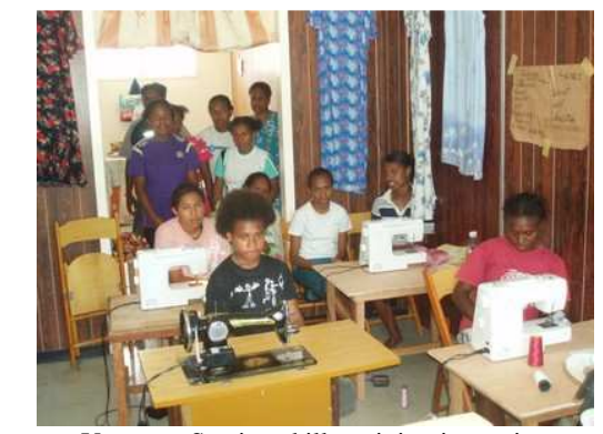
Vanuatu: Sewing skills training in session

• Potential to utilise migrant work experience and overseas work remittances for creating new opportunities for enterprise activities.