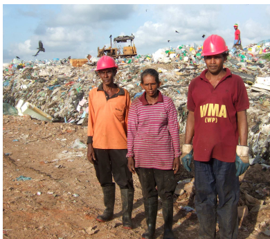
Photo: waste management workers interviewed in Sri Lanka, September 2012