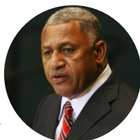
Hon. Voreqe Bainimarama Prime Minister, Republic of the Fiji Islands

Climate-driven displacement isn't some distant doomsday proposition. It is happening right now. In response, we have to change and adapt as quickly as the climate.