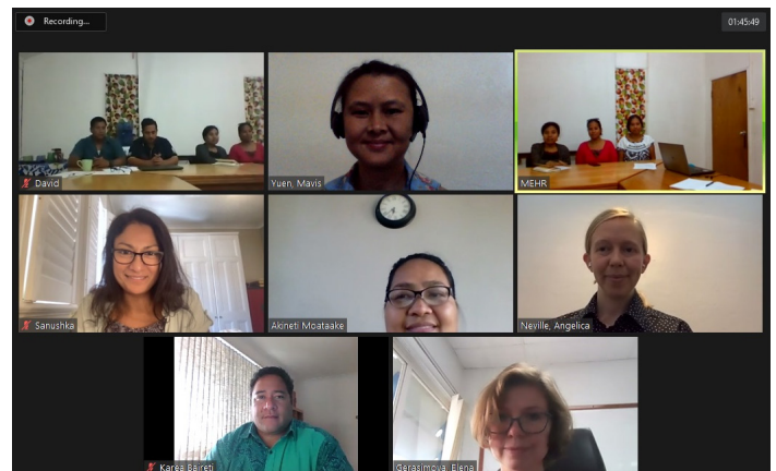
People-centred activity: standard employment contract consultations workshop with Kiribati stakeholders.