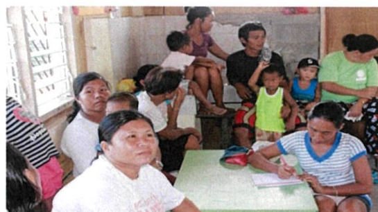
Tawilon Day Care Center Parents, Boston