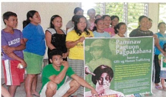
Lambog Day Care Center Paents, Boston