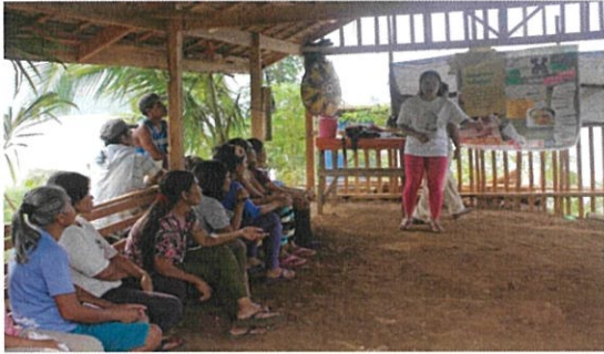
SALT 1- Sibahay, Boston, Davao Oriental