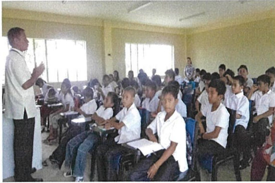
Cateel National Vocational High School