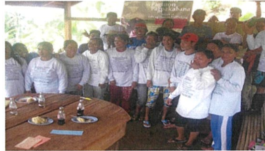
SALT Participants- Cabasagan, Boston