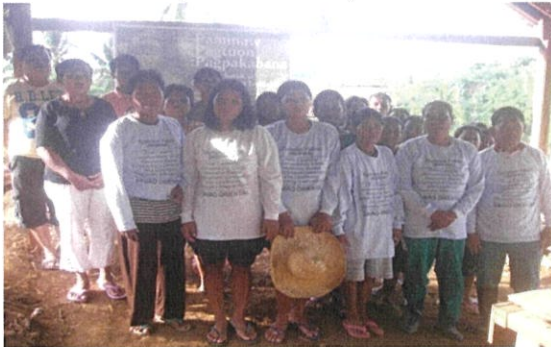
SALT Participants, San Jose, Boston