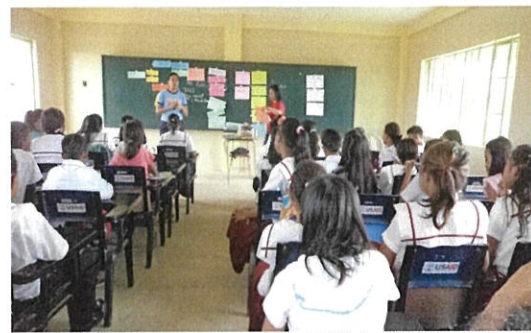
Cateel National Vocational High School