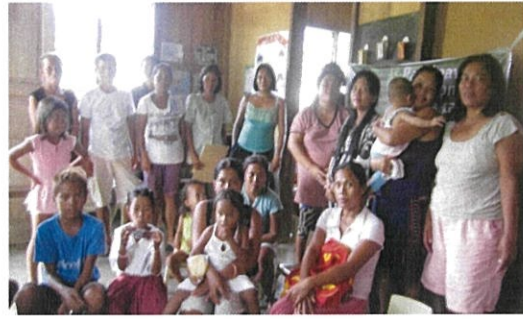
Baclinan Day Care Center Parents, Boston