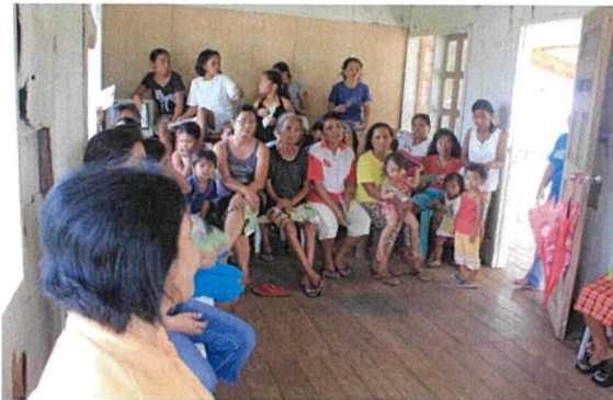
Women Association Members, San Jose, Boston