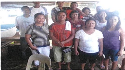
Lobster Association- Boston