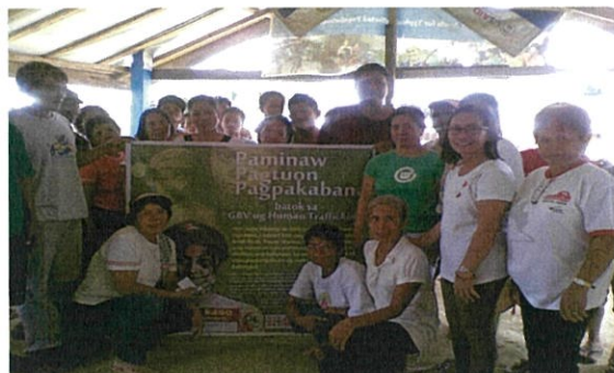
Brgy Alfonso, Cateel, Davao Oriental