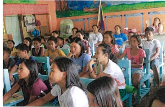
San Jose Elementary School Pupils, Boston