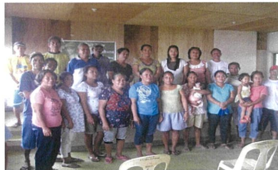
Fisherfolks Association - Poblacion, Boston