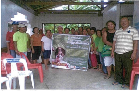
Brgy. San Alfonso Residents