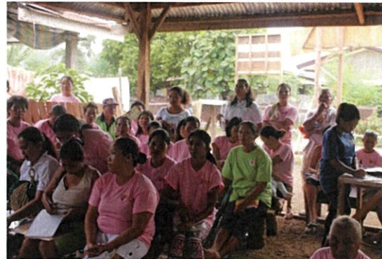
4Ps Members in Camia