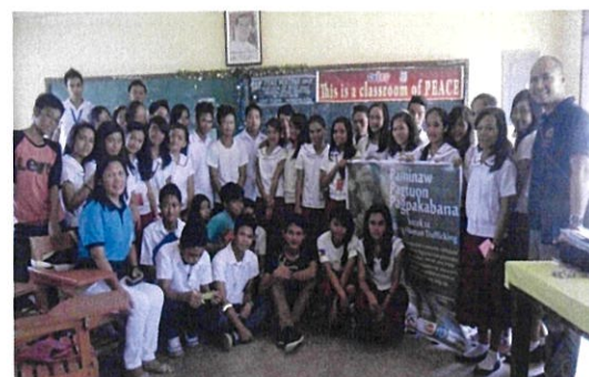
Cateel National Vocational High School - 1 st Year