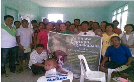
BUGUIS Yahuno Irrigator's Association