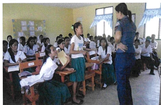
Cateel National Agriculture High School-First Year