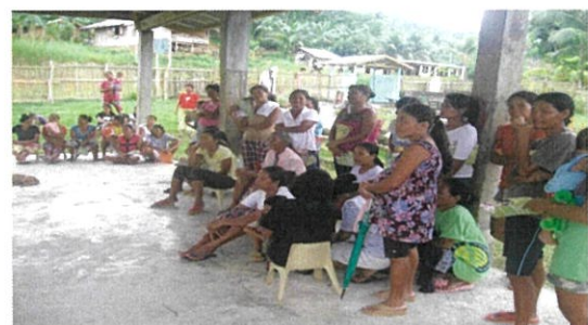
Women Association members - Boston