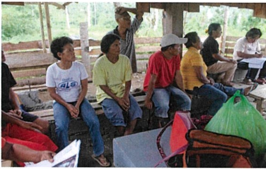
Cabasagan Fisherfolks members, Boston