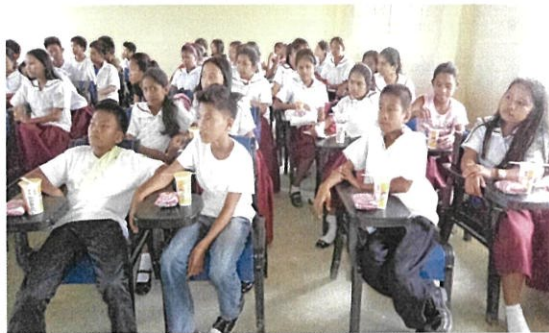
Cateel National Vocational High School