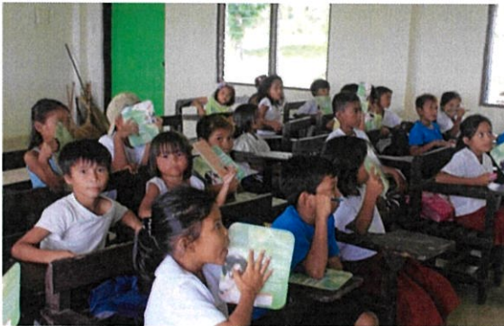
Grade VI Pupils, Carmen Elementary School