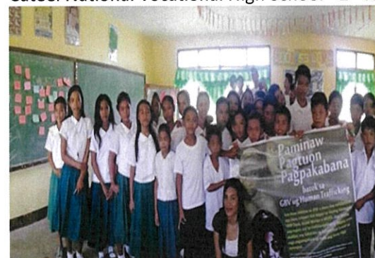
Cateel National Agriculture High School-First Year