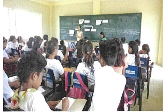
Cateel National Vocational High School