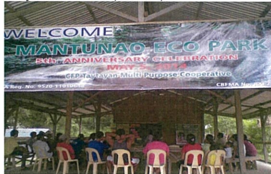
CFP-Taytayan, Cateel, Davao Oriental