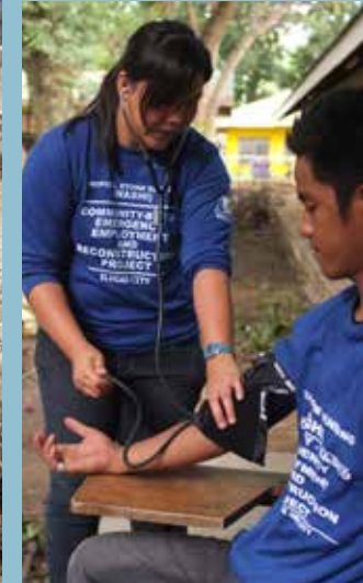
Application of the Local Resource Based Approach