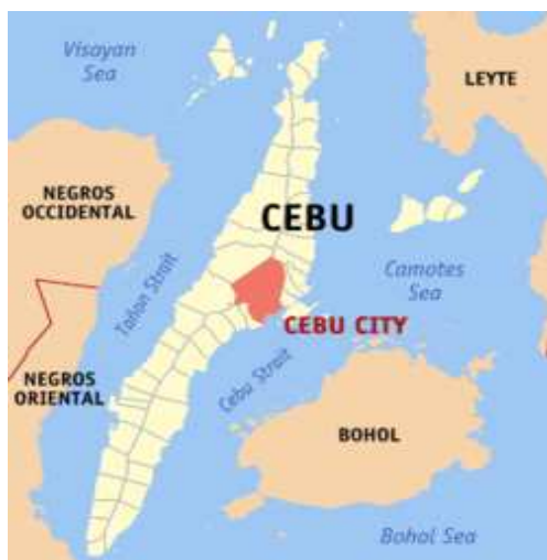
Exhibit 2 – Cebu City is the most progressive city in the Visayas and hosts several migrant workers from

Several households had both spouses working in Cebu and lived with their children in rented temporary residences or houses being amortized. The job loss and accompanying loss in income and benefits, for some both spouses, has caused worry not only for medical needs of their children but also the academic, psychological and emotional changes their children have been going through as a result of transferring from private schools in Cebu to public elementary schools in Bohol.