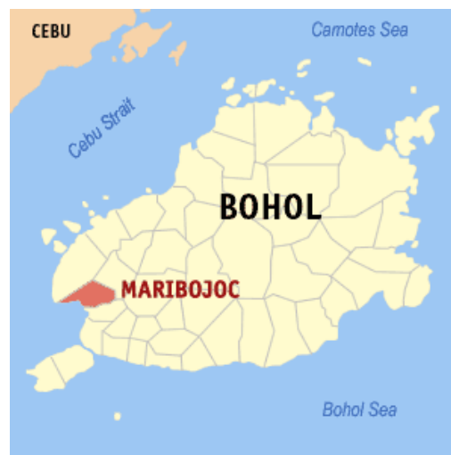
Exhibit 3 – Maribojoc is a 5 th class municipality in the province of Bohol