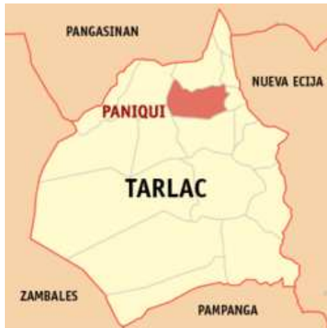
Exhibit 4 – Paniqui, Tarlac, north of Metro-Manila

The results of the FGDs also convey the possibility of harnessing the support network within the community particularly outside large urban cities. Awareness of assistance provided by the government and other socio-civic organizations was shared within the groups. Several on-going programs were apparently not known even within the community implying the need for better information dissemination.