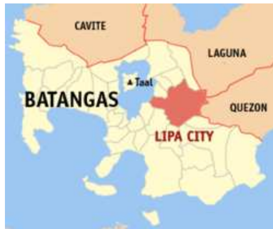
Exhibit 5 – Lipa City, Batangas, south of Metro-Manila