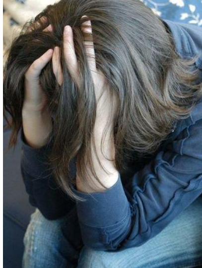
Photo: The report found women, men and children were at risk of exploitation.

A report released today warns the problem of human trafficking for exploitation in New South Wales [a state in Australia] is "far more widespread than anyone would care to estimate".