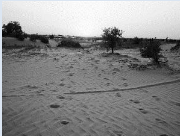
The sun sets near the Egypt-Israel border on 30 April 2013, sealed off since early 2013 by a five metre-high Israeli fence. Trafficking victims told Human Rights Watch that, throughout 2012, Egyptian border guards or unknown men fired at them as they approached the border.

(Berlin) - Traffickers have kidnapped, tortured, and killed refugees, most from Eritrea, Eastern Sudan, and Egypt's Sinai Peninsula, according to dozens of interviewees, said Human Rights Watch (HRW). Egypt and Sudan have failed to adequately identify and prosecute the traffickers and any security officials who may have colluded with them, breaching both countries' obligation to prevent torture.