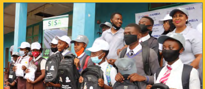
Mufulira Secondary School pupils pose for a photo during the prize presentation ceremony

Among the schools that participated in the essay competition were Mufulira Secondary School, Kalulushi's St. Maceline Secondary School, and Ndola Girls National Technical Secondary School.