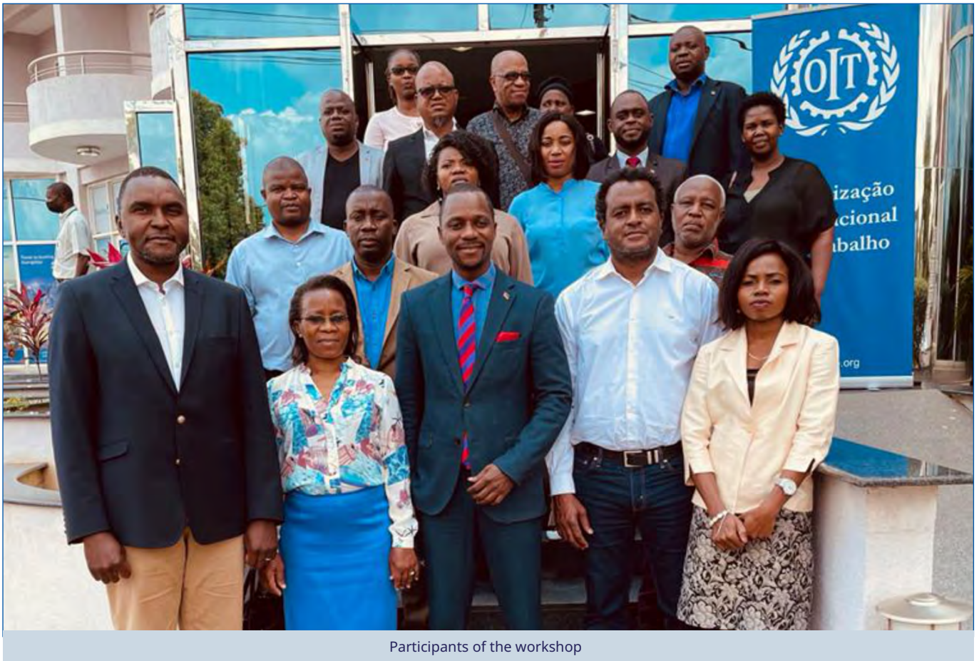
Participants of the workshop