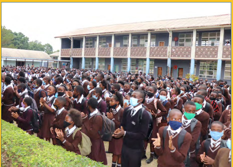
Mufulira Secondary School pupils during the school outreach programme