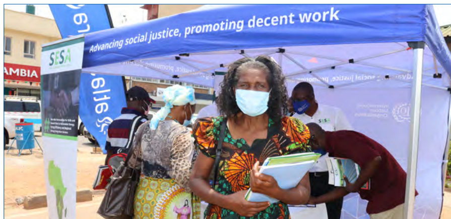
Participants at the SESA Project stand