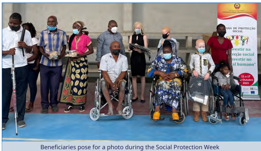
Beneficiaries pose for a photo during the Social Protection Week