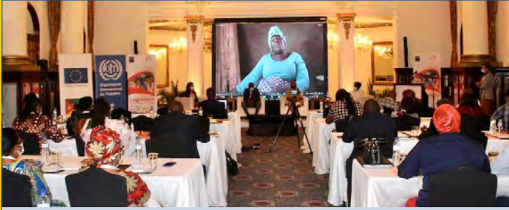
Parliamentarians watch the ILO documentary 'Linda' during the high level session of the conference

The video stimulated debate among participants around the need for expanded fiscal space for social protection, being presented one week before the National Assembly's discussion on next year's State budget. The Social Protection Week ended with a ceremony organized by MGCAS with ILO's support in celebration of the White Cane Safety Day in the District of Chamanculo, Maputo. During the event, in-kind support was distributed to persons living with disabilities and persons living with albinism, including wheelchairs, white canes, corrective glasses, and sunscreens.