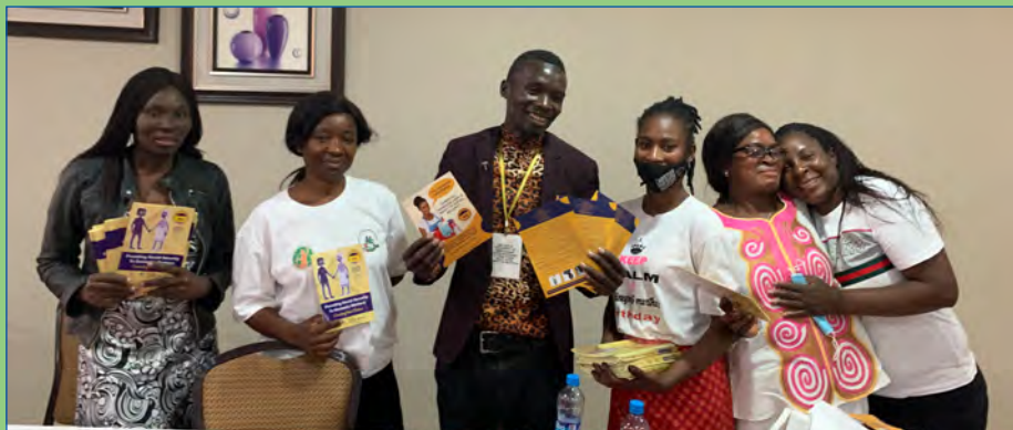
ILO recently conducted the sensitization meeting of Maid Centres and Recruitment Agencies

"Many black Zambians are being abused and are not saying anything because they are scared to lose their jobs, they have children to take care of, so they keep quiet", she says.