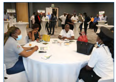
Some participants during the Meeting