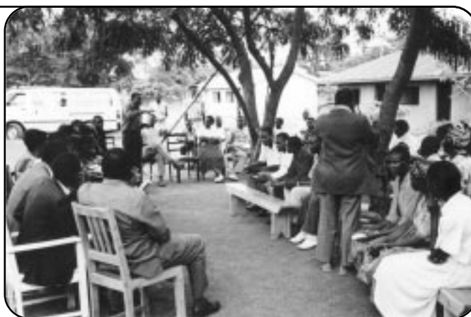
Community participating in planning

Proper planning is essential to ensuring that the assets created benefit the communities for which they were created. Local-level planning involving the participation of target beneficiaries in the identification, prioritization, and actual implementation results in the creation of assets that address the real needs of the communities, and