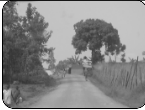
Model road built with labour-based methods in Mbale, Uganda

(IRAP) tool developed by the ILO, which facilitates local-level planning and has been applied in a number of countries. Now, its impact on poverty in these countries needs to be clarified, as does the issue of whether there was/is sufficient capacity at local level to support local-level planning? Do the recent trends in decentralisation support such a bottom-up approach?